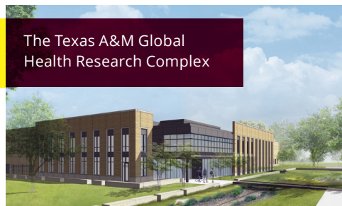
The Texas A&M Global Health Research Complex

Research centers and institutes play an important role in the research and academic landscape at Texas A&M, bringing together scholars and scientists—often from different disciplines—to tackle major research challenges. research.tamu.edu/centers